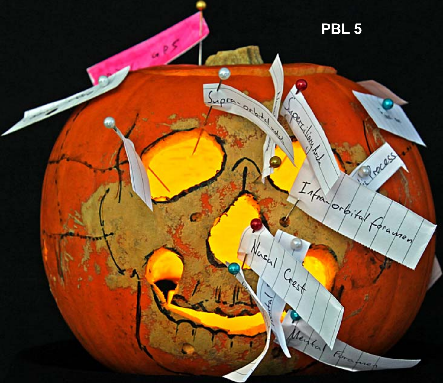
... well labelled !